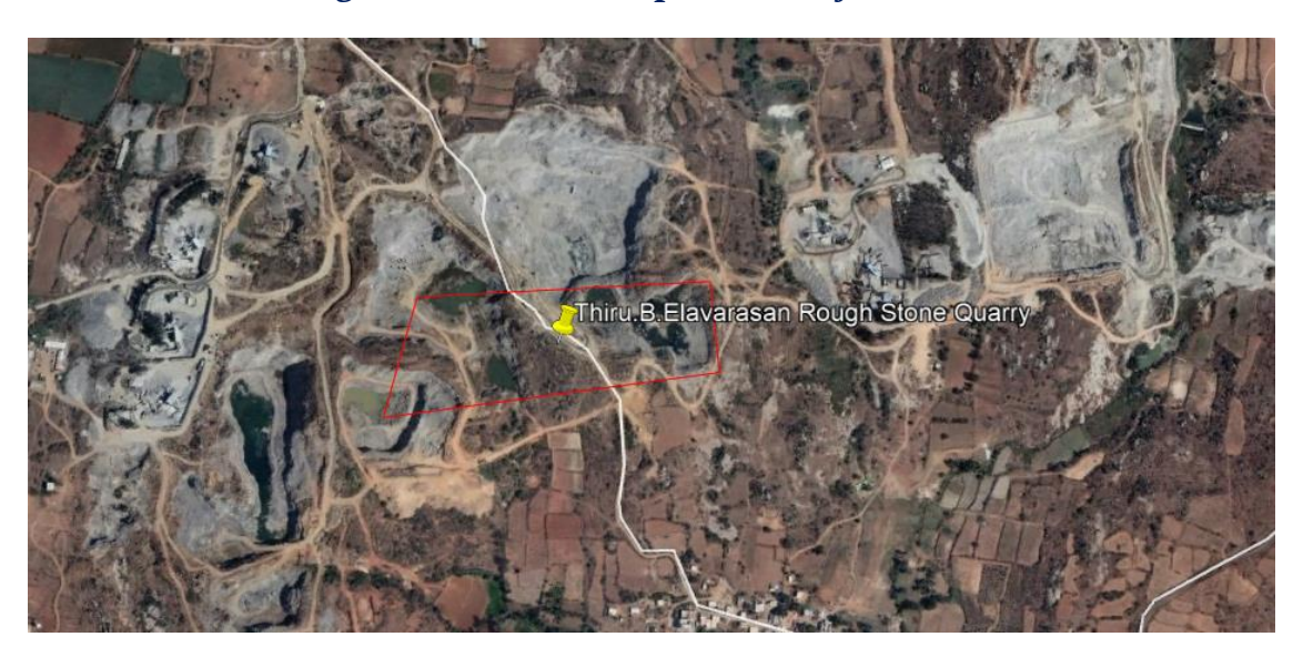
Figure 2: Google Image of the Project Site