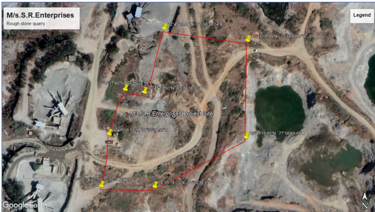
Figure 2: Google Image of the Project Site