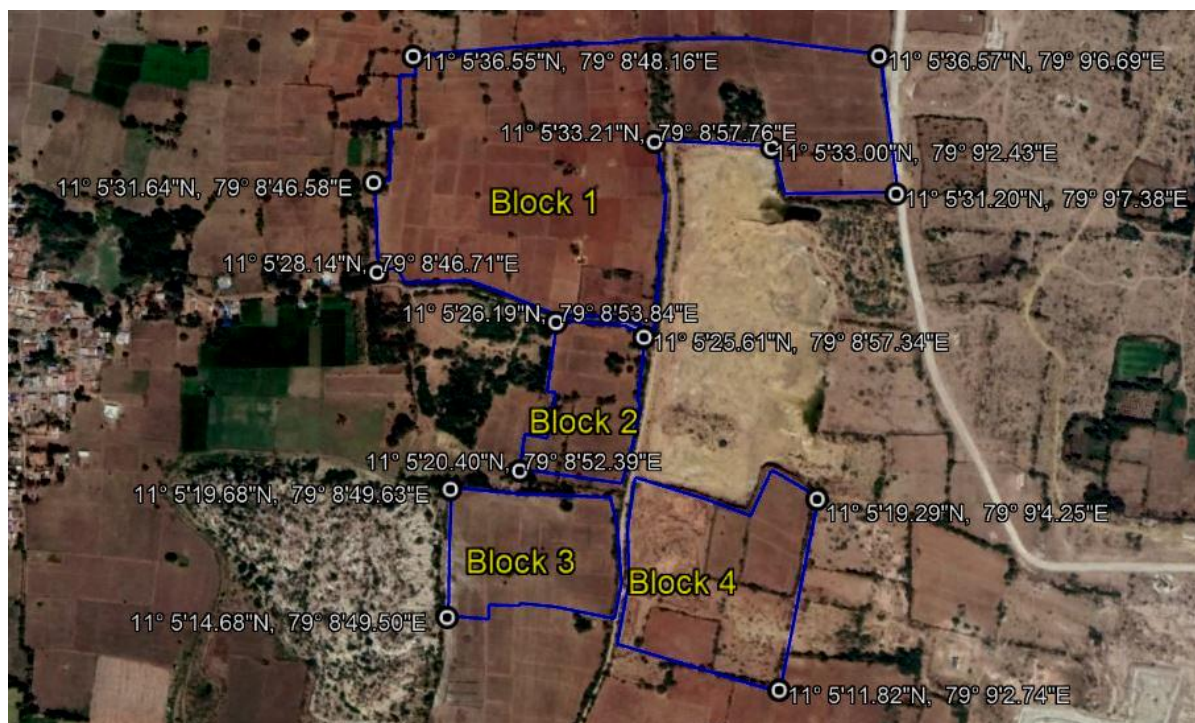
Figure 2 Google Image of the Project Site