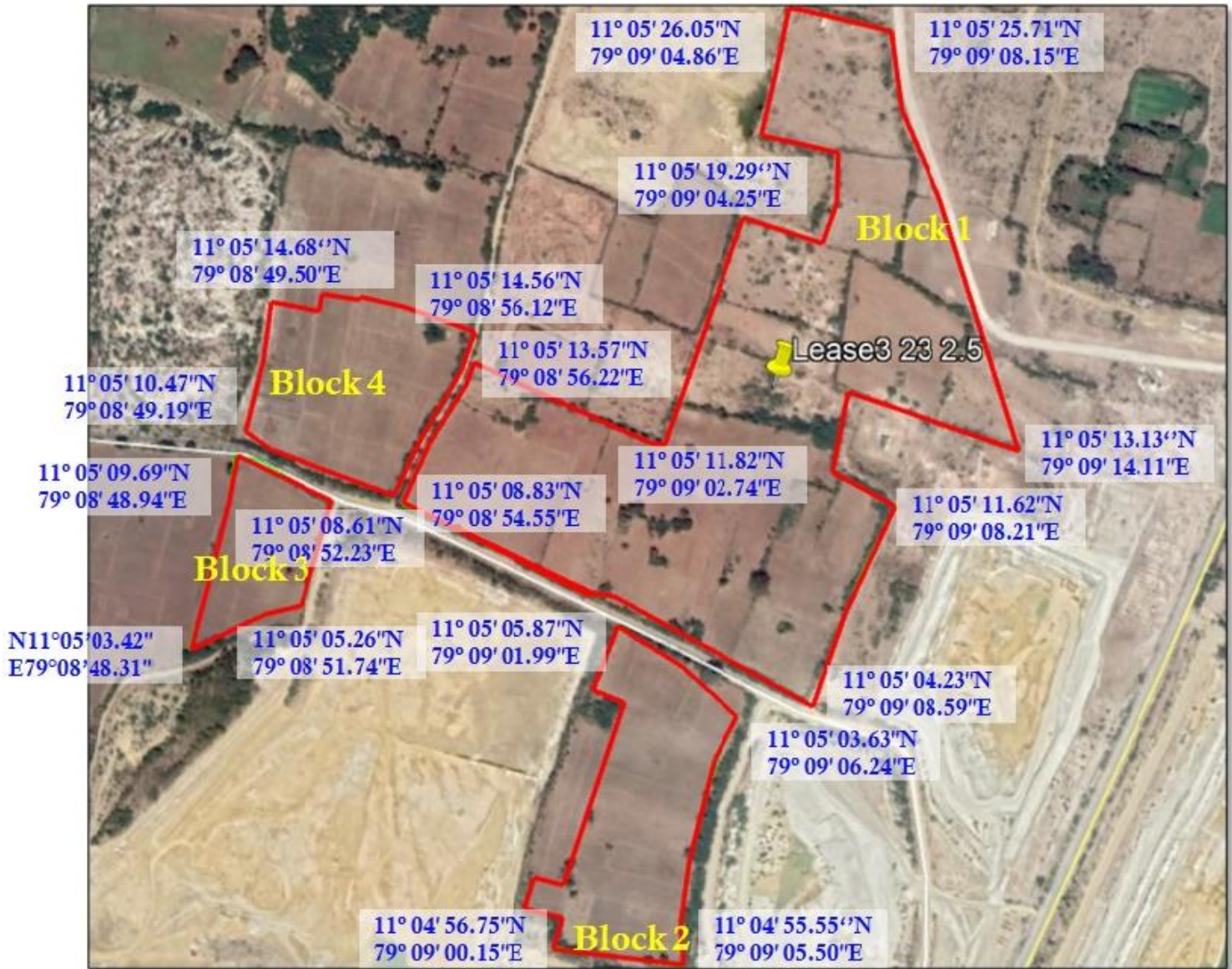
Figure 2 Google Image of the Project Site