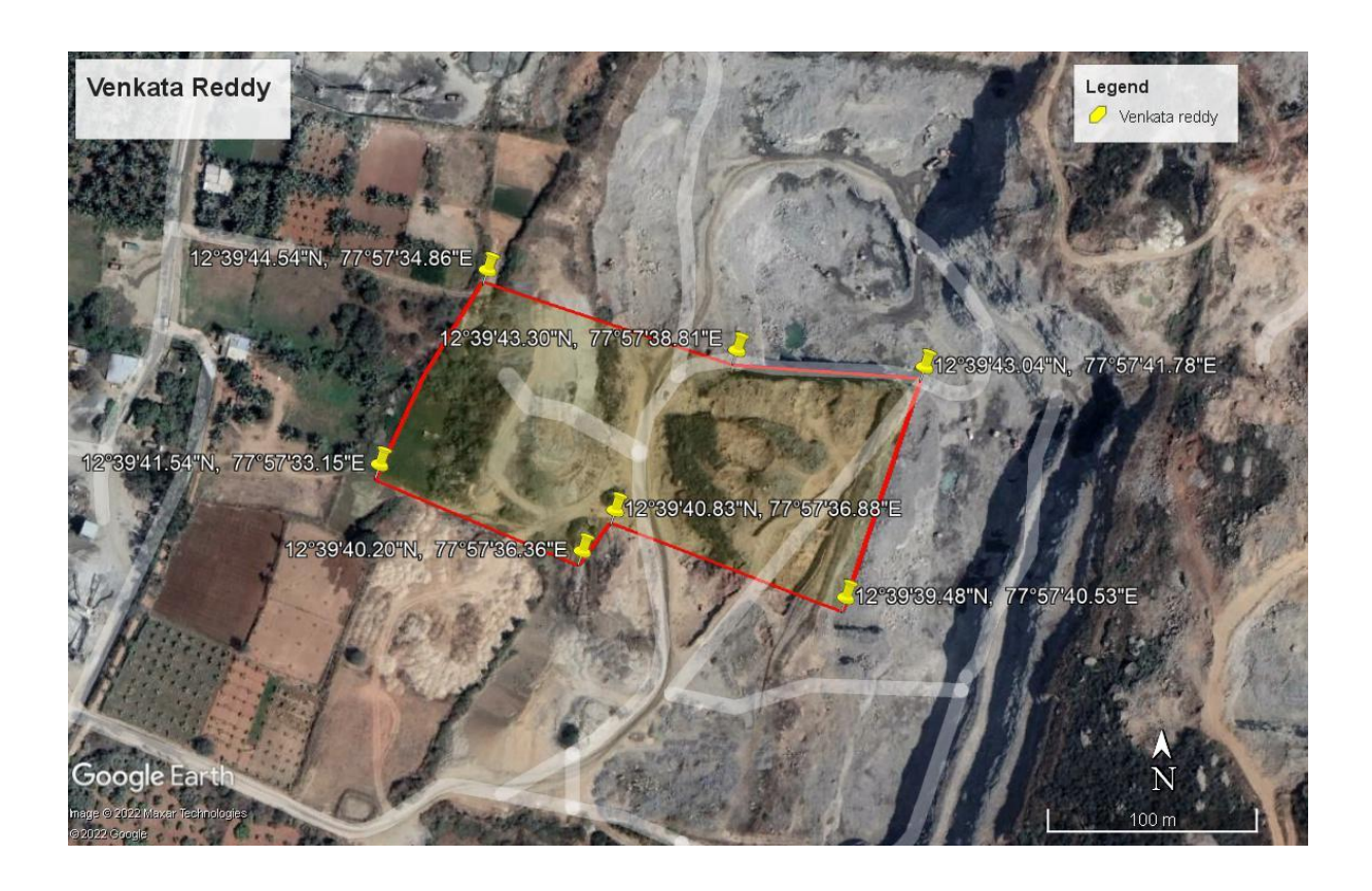
Figure 2: Google Image of the Project Site