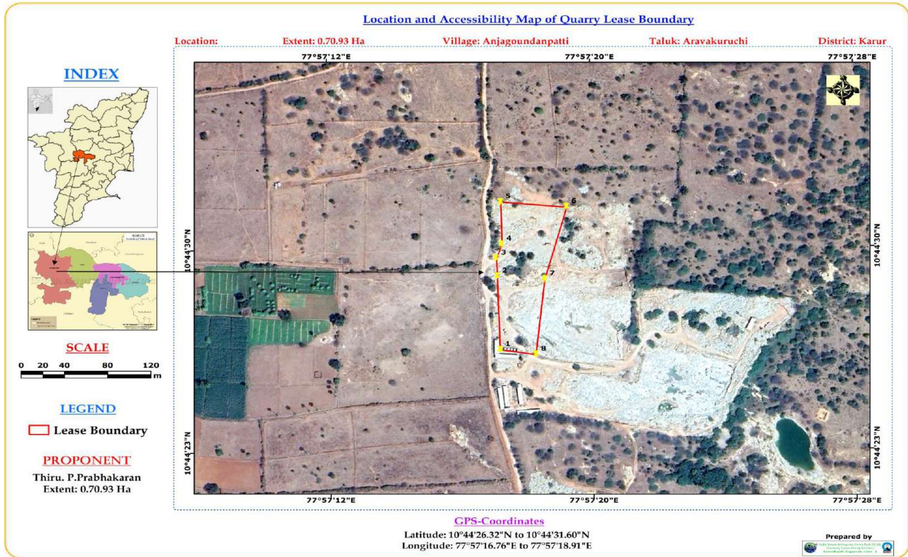
Fig No. 2: Map Showing the Location and Accessibility of Quarry Lease Boundary

Proponent: P.Prabhakaran, Ordinary Stone and Gravel Quarry, Karur District